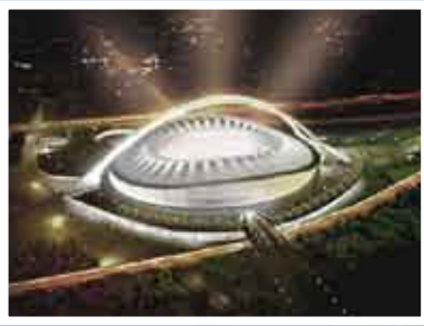
Stadio per calcio