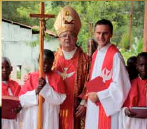
Stanislaw Dziuba bishop of diocesi of Umzimkulu.